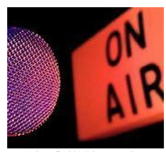
Radio is affordable 7 days per week